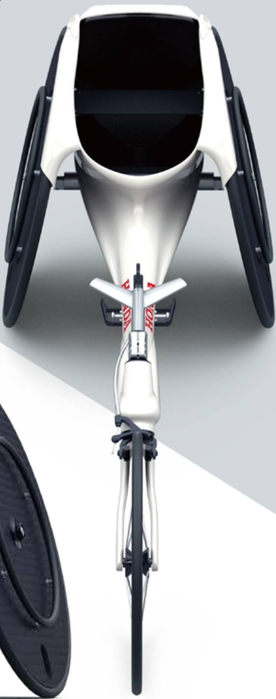
*Optional color (white)

The wing-shaped main frame is the product of carbon technologies developed for F1 racing and HondaJet. It combines superior physical properties with sharp, motivating design.